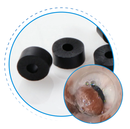
SmartBand Multi-Band Ligation Kit