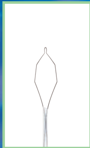
Stage 2: 10mm hex