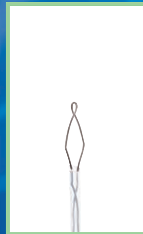
Stage 3: 6mm diamond

For more information on the Lariat™ snare, contact US Endoscopy today.