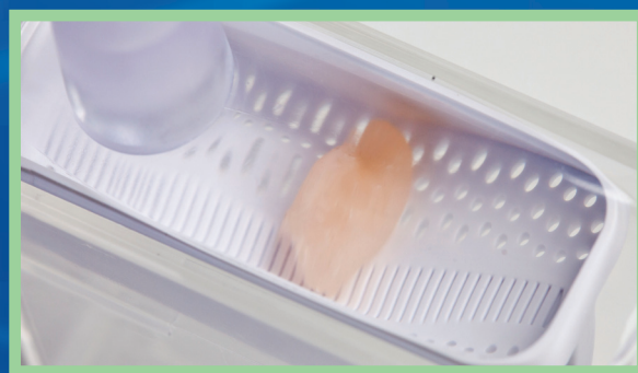
specimen captured in eTrap® polyp trap

For more information on the eTrap® polyp trap, contact your local representative today.